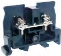
ASI391002 Terminal block UTD-15