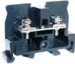
ASI391003 Terminal block UTD-24