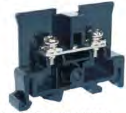
ASI391001 Terminal block UTD-10