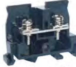
ASI391004 Terminal block UTD-32