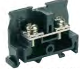
ASI391005 Terminal block UTD-41